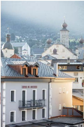
Typical geometric patterns from local paintings and crafts on the facade