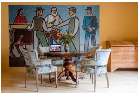
Otto's Stuba – another kind of meeting room