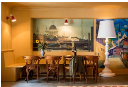
Cosy Living Room with honesty bar